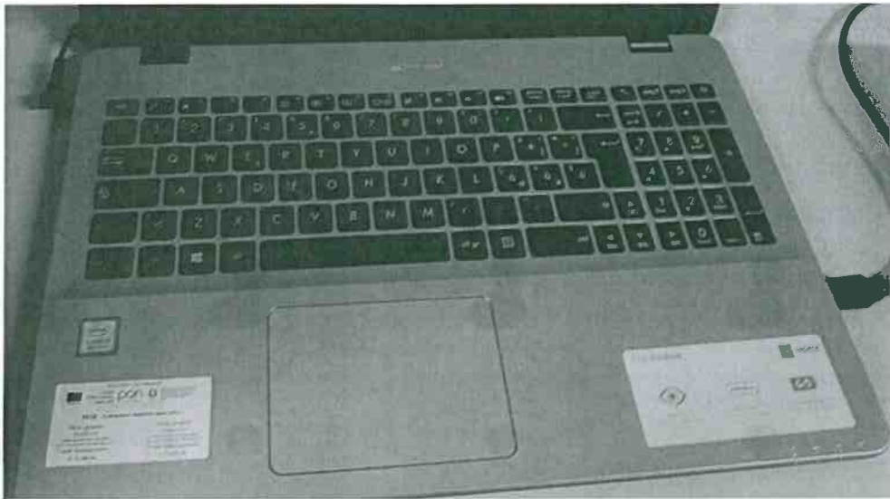
Immagine n. 7