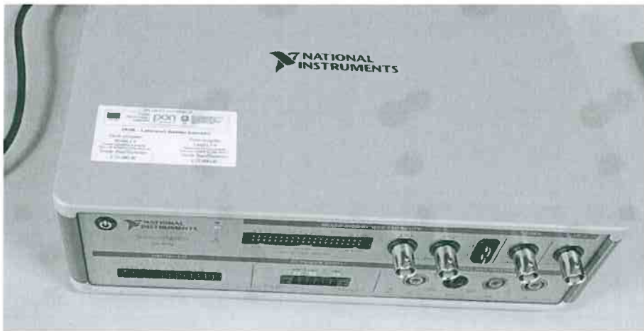
Immagine n. 6